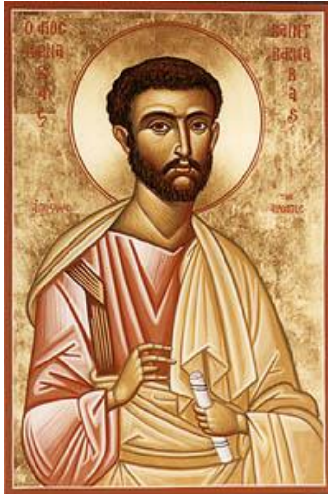
Barnabas, Son of Encouragement