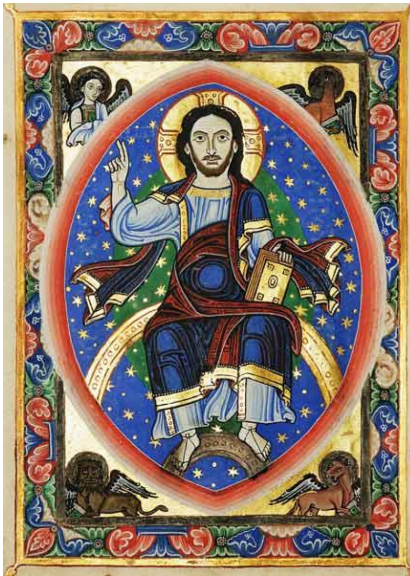
Majestas Domini, Ferdinand Hodler. Swiss, 1853-1918