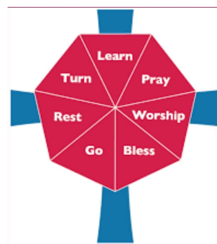
THE WAY OF LOVE Practices for Jesus-Centered Life

From Presiding Bishop Curry - In the first century Jesus of Nazareth inspired a movement. A community of people whose lives were centered on Jesus Christ and committed to living the way of God's unconditional, unselfish, sacrificial, and redemptive love. Before they were called "church" or "Christian," this Jesus Movement was simply called "the way." Today I believe our vocation is to live as the Episcopal branch of the Jesus Movement. But how can we together grow more deeply with Jesus Christ at the center of our lives, so we can bear witness to his way of love in and for the world?