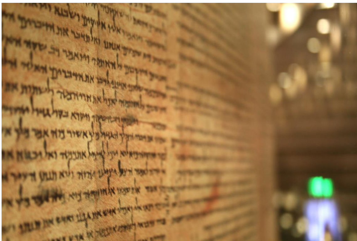
Scroll of Isaiah from Qumran