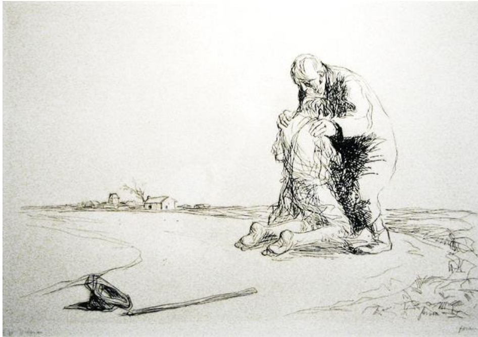
Prodigal Son, Forain, Jean Louis, 1852-1931