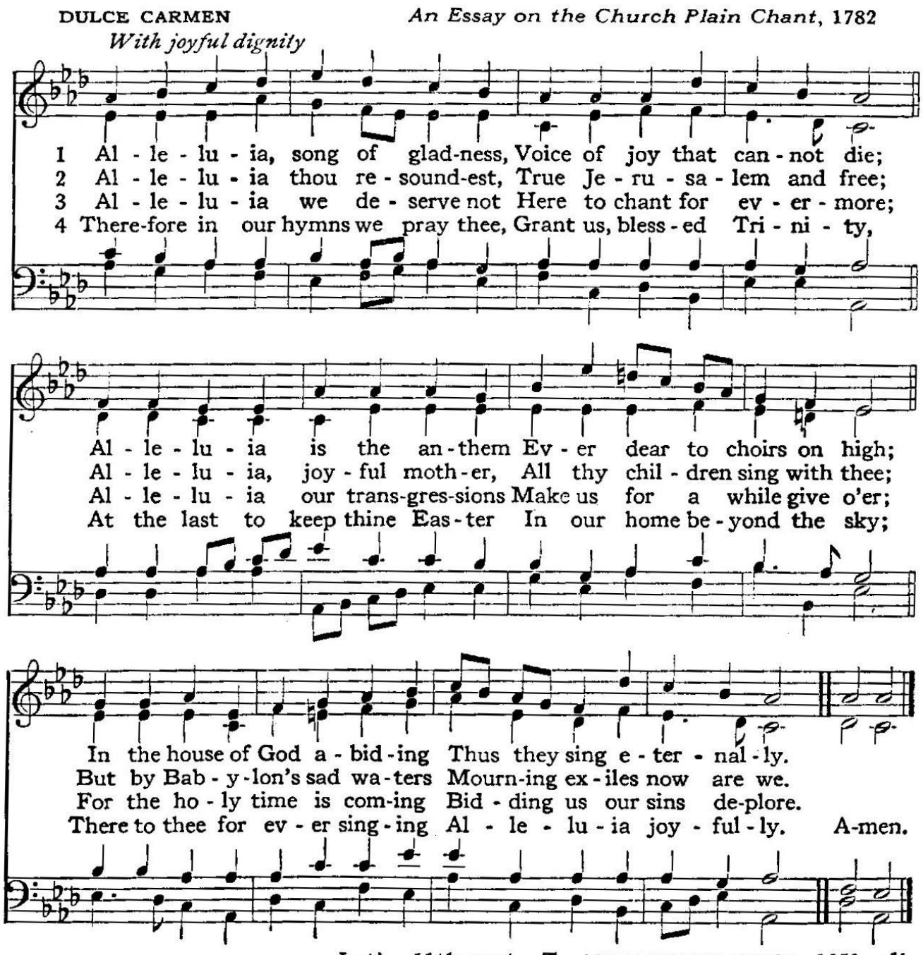
Latin, 11th cent.; Tr. JOHN MASON NEALE, 1851, alt.