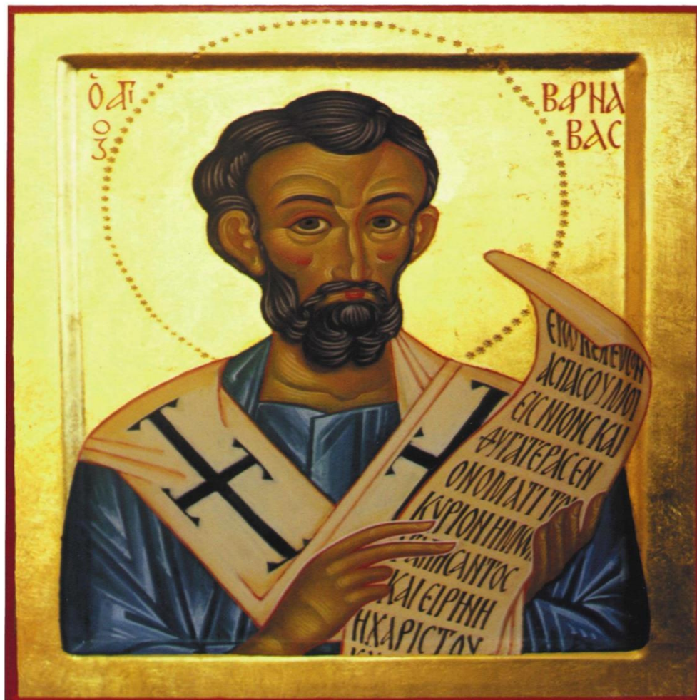
Barnabas, Son of Encouragement