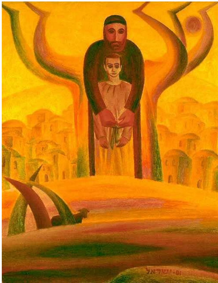
Abraham and Isaac Israel Tsvaygenbaum