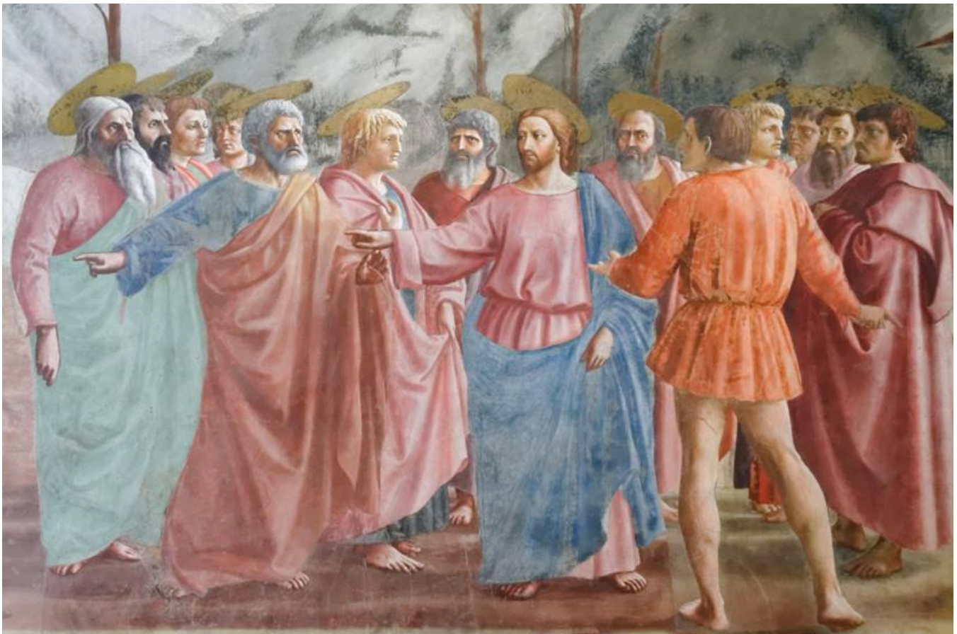
Tribute Money Masaccio, 1401-1428