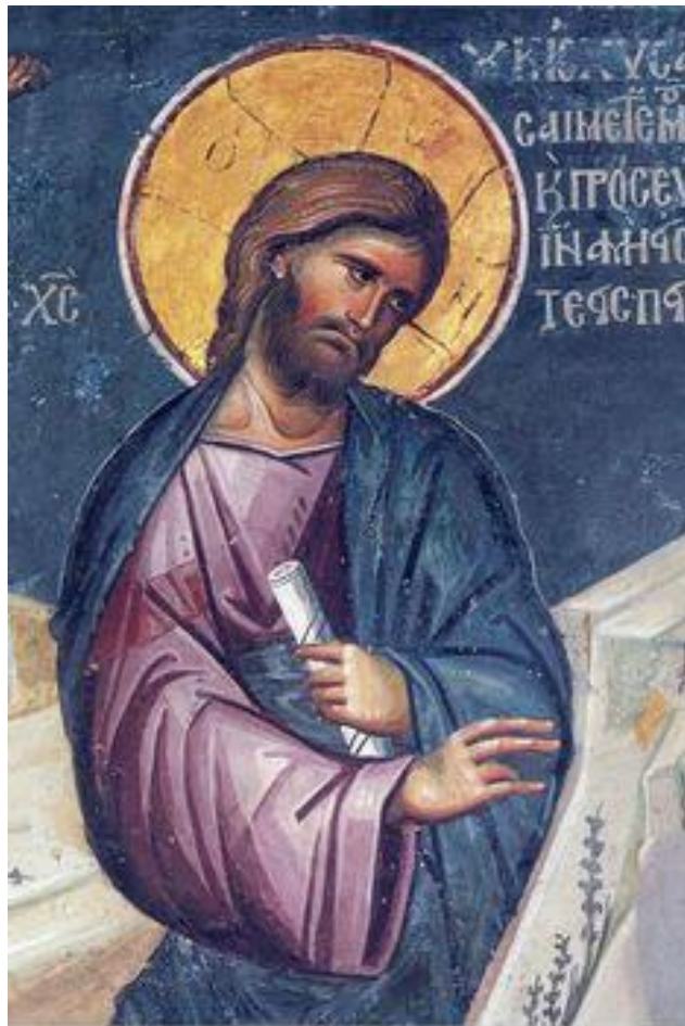
Christ the King