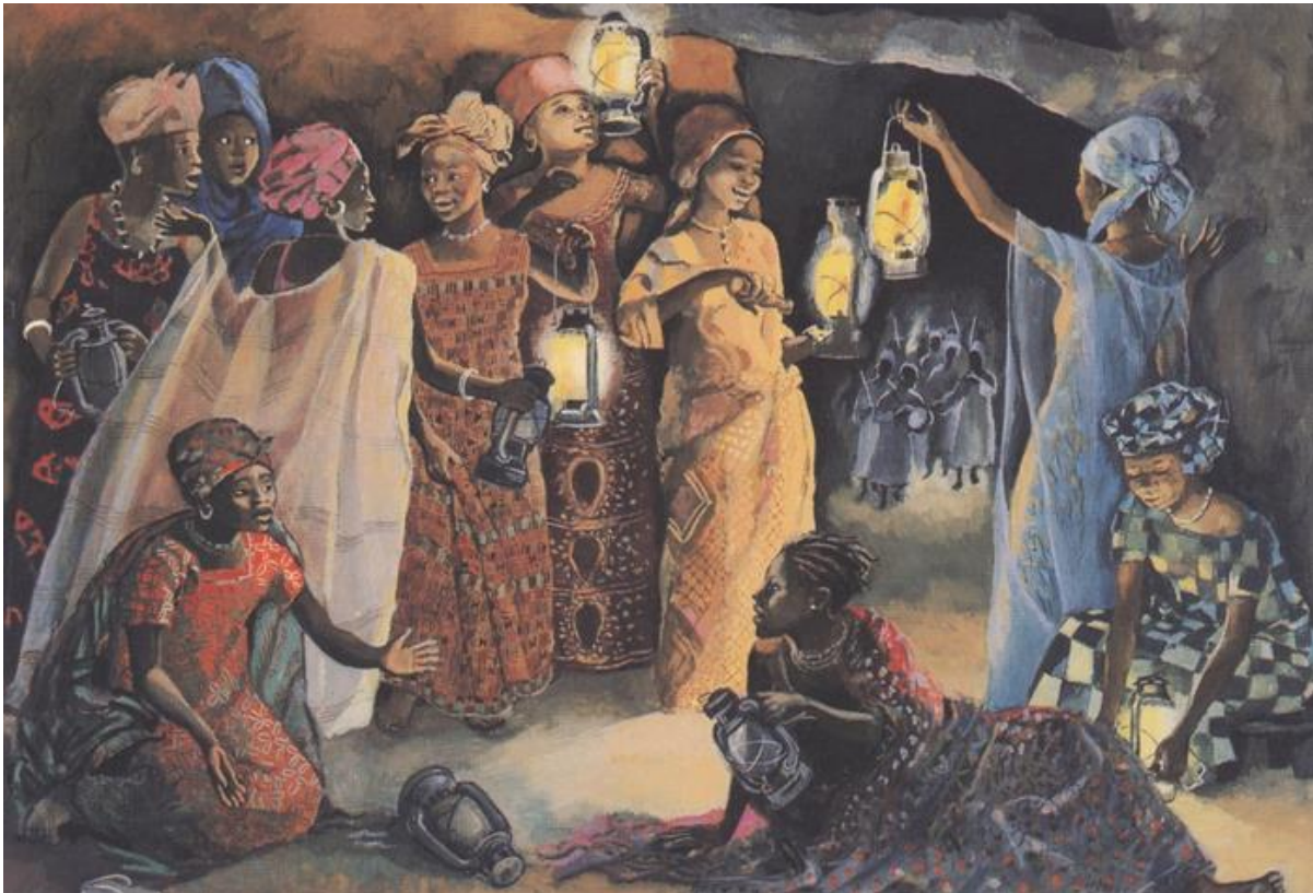
The Ten Young Women Jesus Mafa, 1973