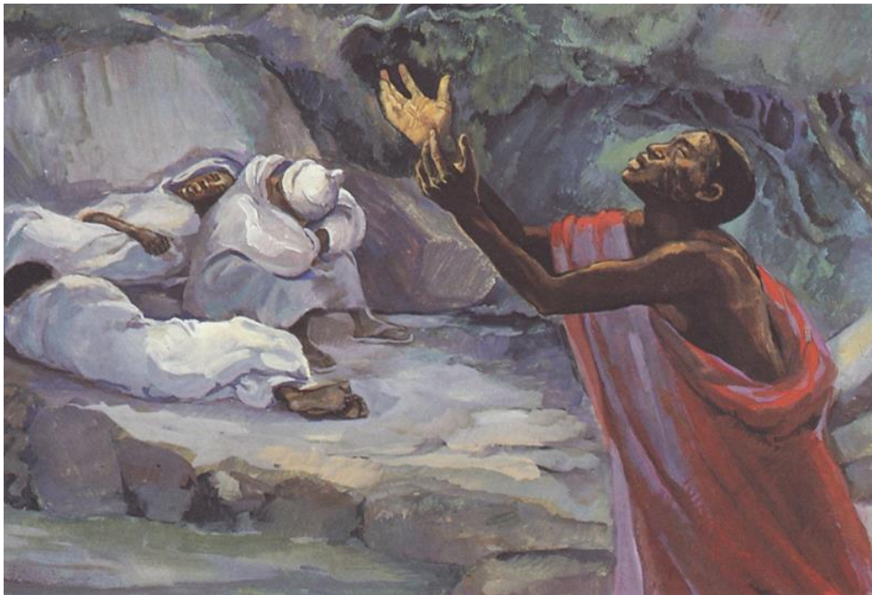
Christ on Gethsemane

From A Clearing Season: Reflections for Lent