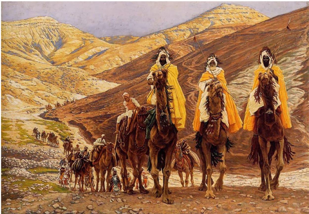
James Tissot, The Journey of the Magi, ca. 1894