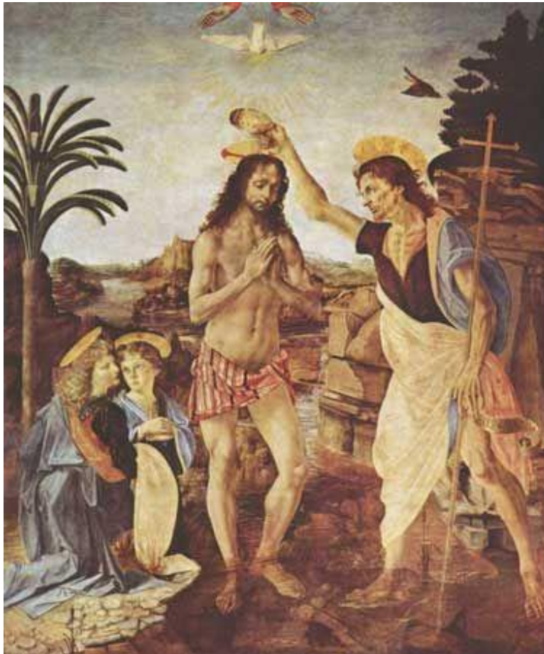
The Baptism of Christ, Verrocchio and Da Vinci, from the Uffizi Gallery, Florence, Italy.