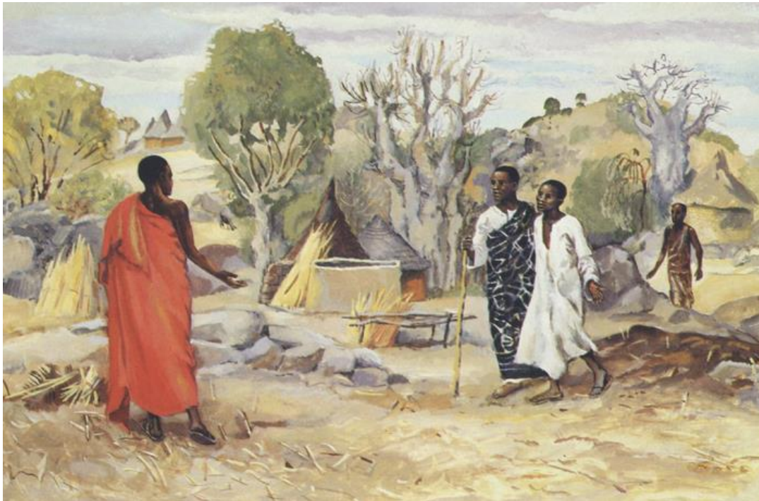
The first two disciples Jesus Mafa, 1973