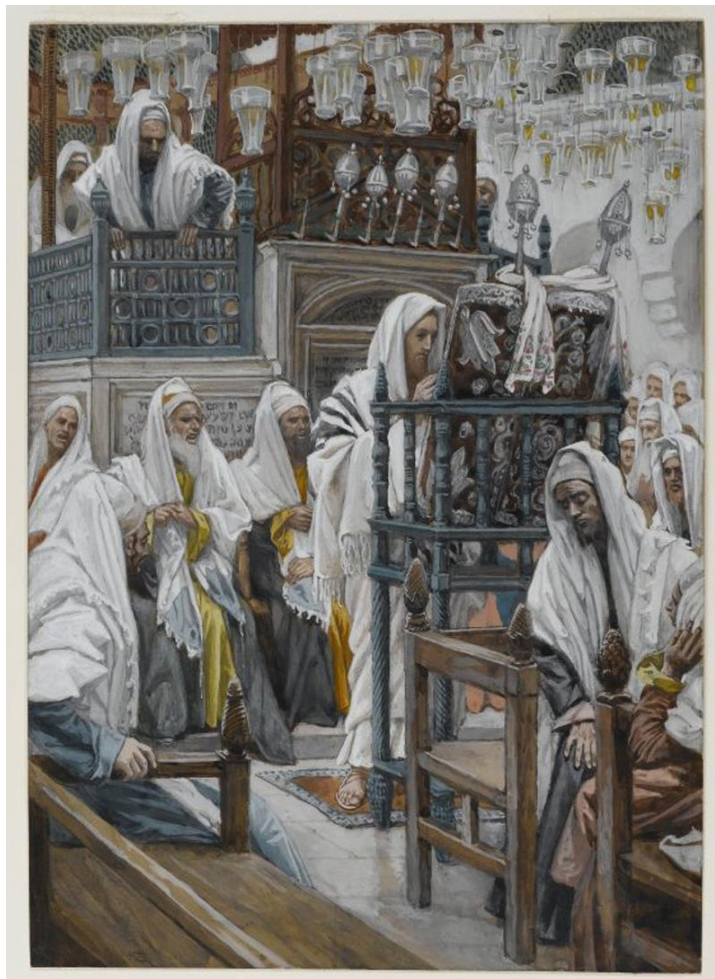
James Tissot, Jesus Unrolls the Book in the Synagogue, 1886-1894, watercolor. Brooklyn Museum, New York