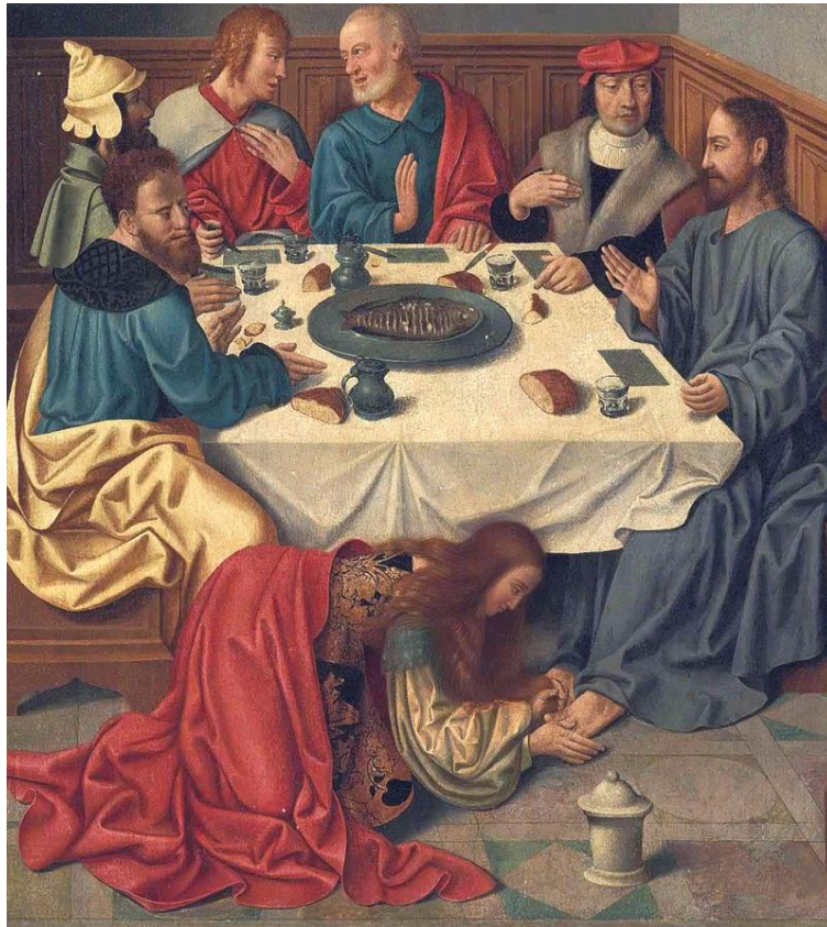
Mary Anoints Jesus' Feet - Anonymous (German school, 16th century)