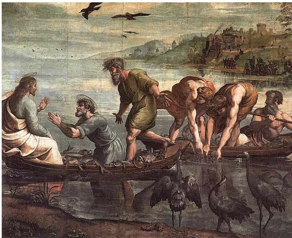
Miraculous Draught of Fishes