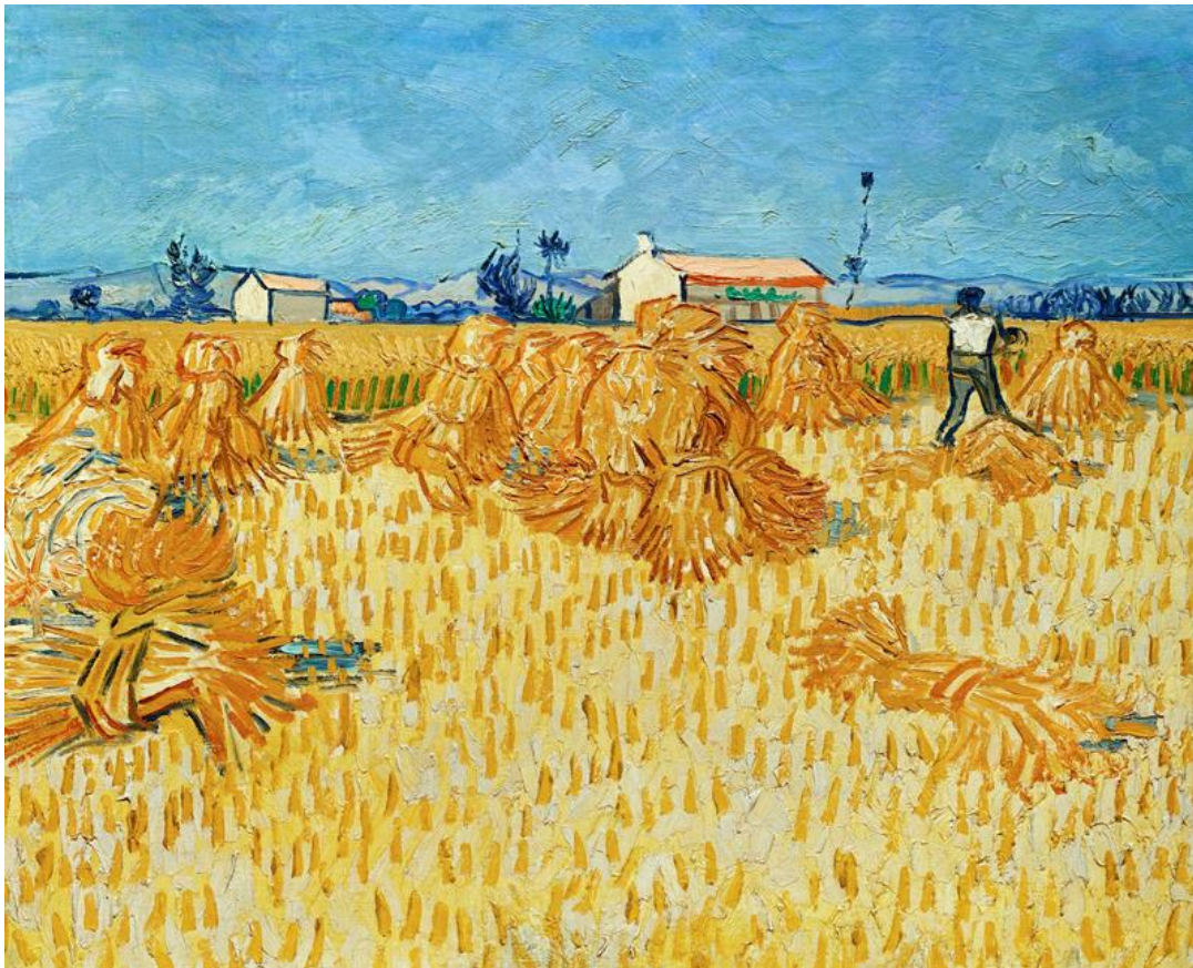
"Harvest in Provence", 1888 Vincent van Gogh, 1853-1890

Ye servants of God, your Master proclaim