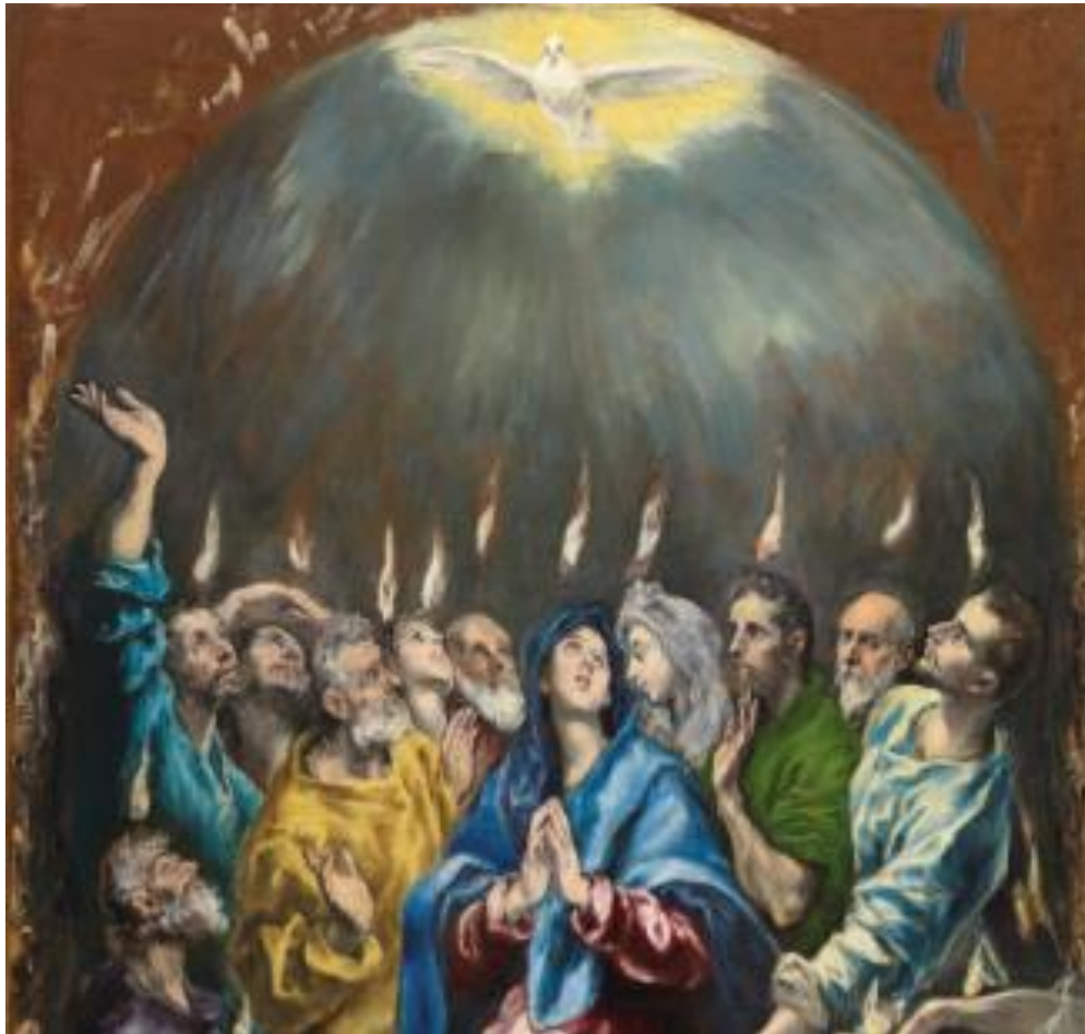
"Pentecost" Ca. 1600 El Greco