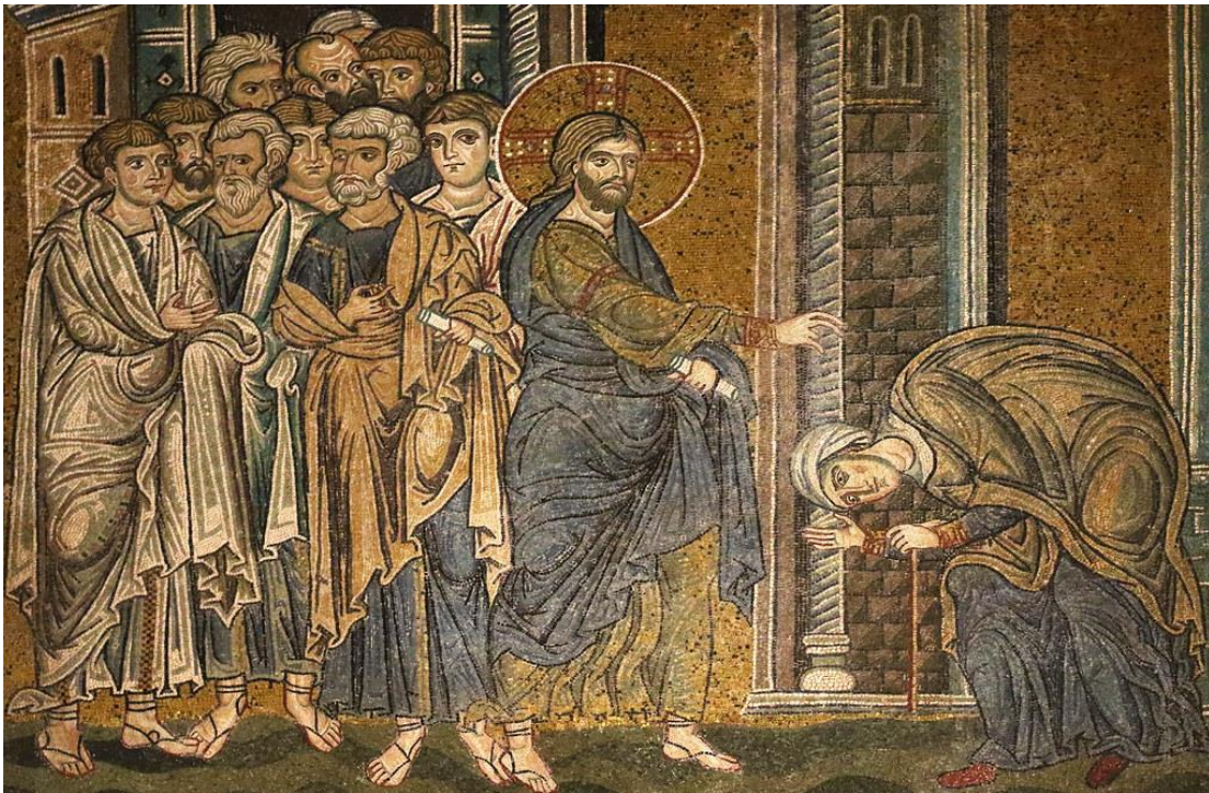
Healing of a crippled woman - 12th century mosaic Duomo di Monreale (Cattedrale di Santa Maria Nuova)