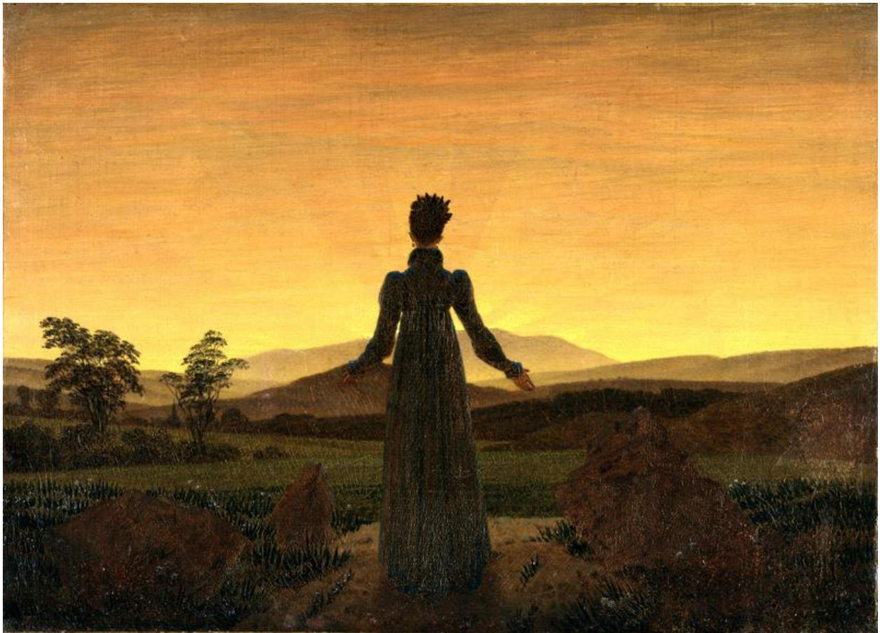
Woman before the Rising Sun (Woman before the Setting Sun), approx. 1818 Caspar David Friedrich, 1774-1840

HYMN (sung by all, next page) Father, we praise you, now the night is over