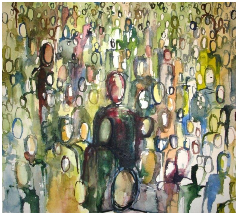
The Multitude of Saints