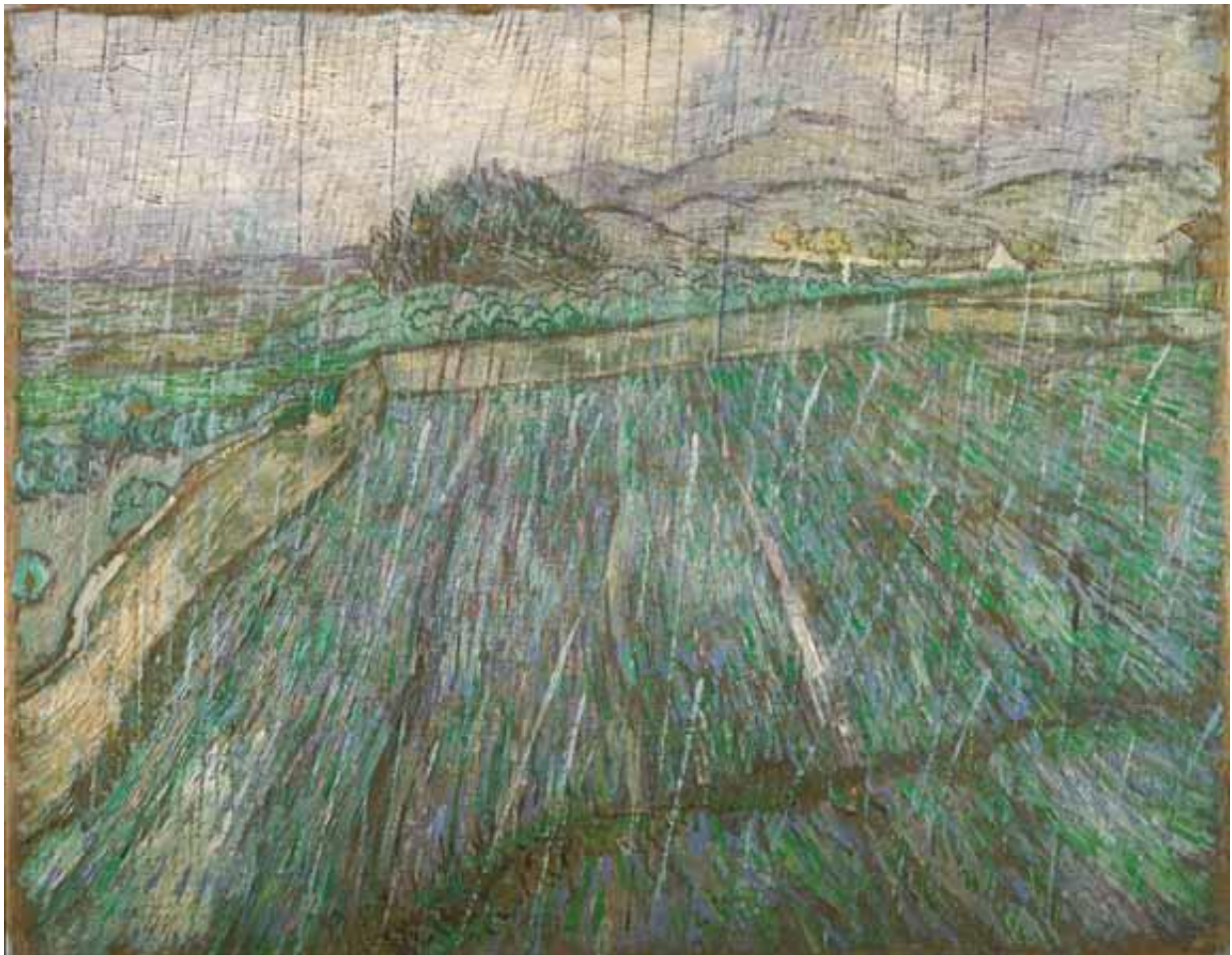
Wheat Field in Rain, 1889 Vincent van Gogh, 1820-1888