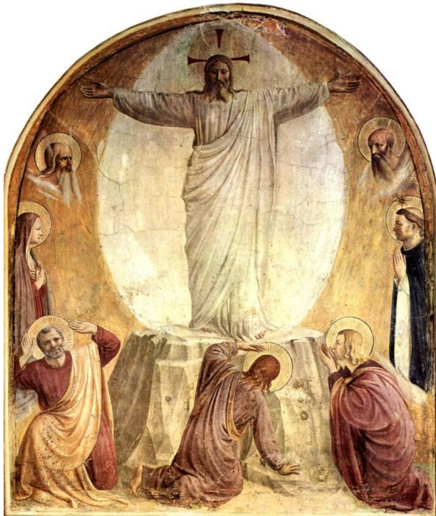
Fra Angelico, Transfiguration, 1450.