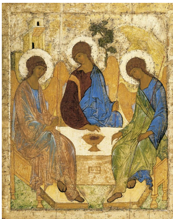
Hospitality of Abraham Andrei Rublev -approximately 1430