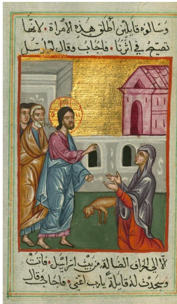
The Canaanite Woman asks for healing for her daughter, 1684