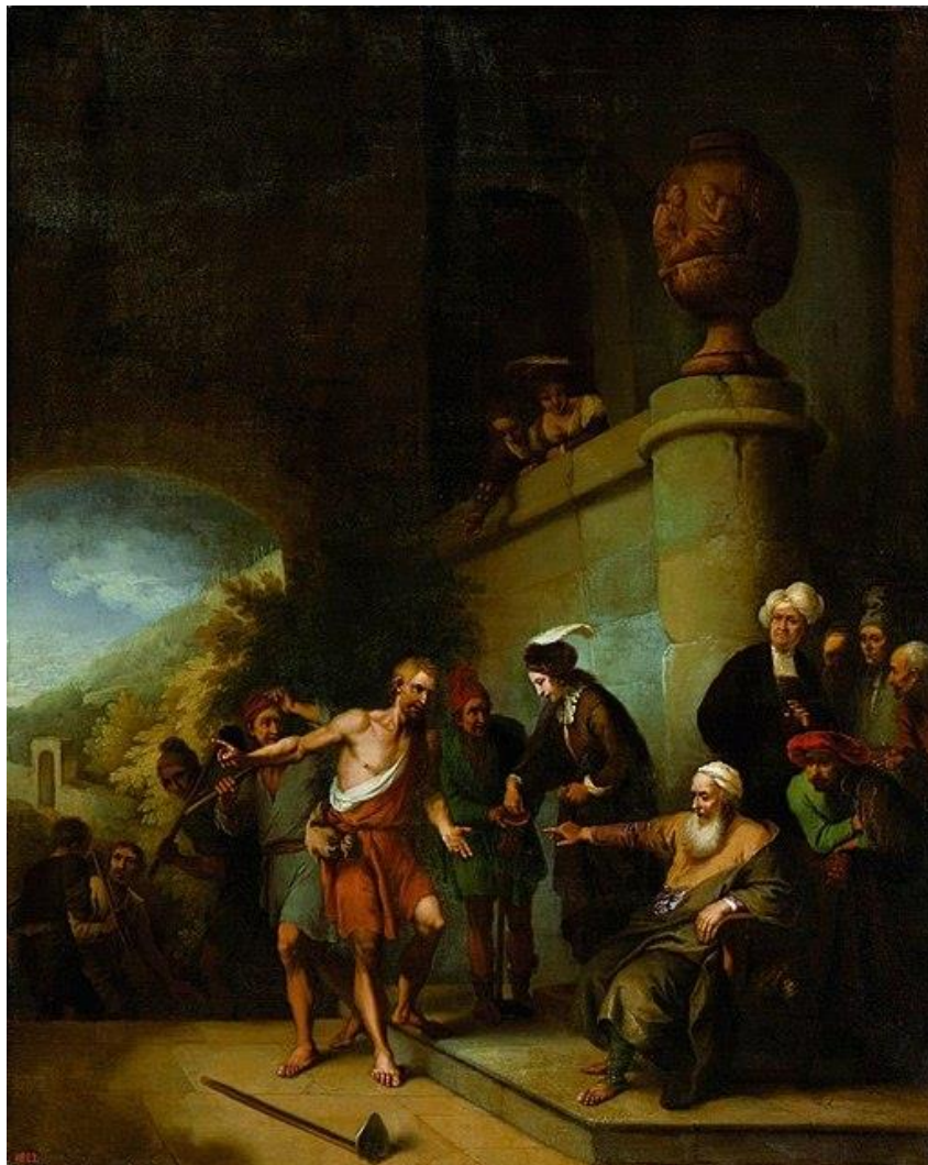
Parable of the Workers in the Vineyard Christian Dietrich