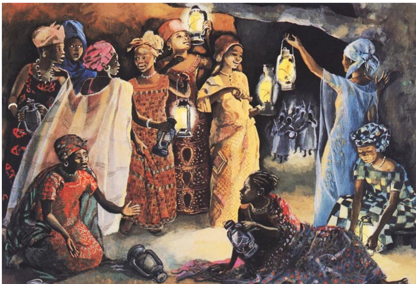
The Ten Bridesmaids -- JESUS MAFA, Cameroon