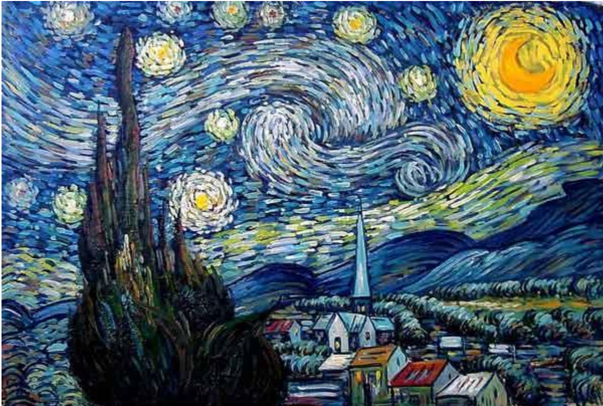
Starry Night, Vincent Van Gogh, 1889. Museum of Modern Art.