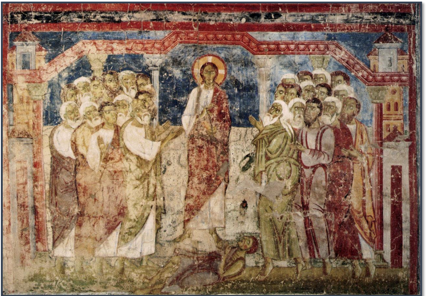
Exorcism at the Synagogue in Capernaum, Fresco