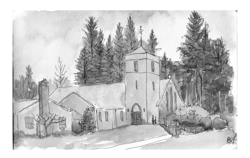
WHO ARE WE?

We are a community of faith that welcomes and values all people. We commit to follow Christ, serve others, grow in faith, and transform the world by sharing God's love.