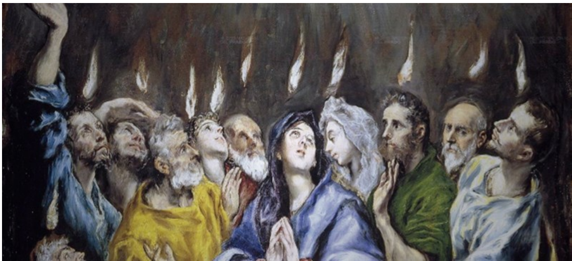
“Pentecost” Ca. 1600 El Greco

Welcome to St. Barnabas, we are delighted that you're here. We hope you'll participate fully in our worship through singing, praying, bearing the Good News of Jesus Christ, and coming to communion. May God richly bless you as you bless us!