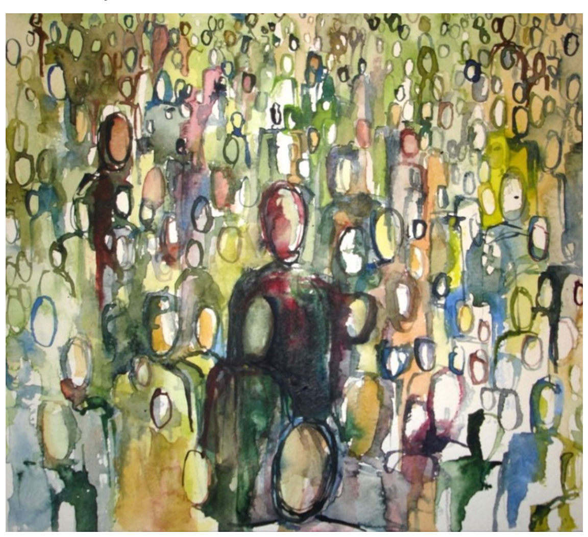
The Multitude of Saints

All stand as able at the sound of the tower bell.