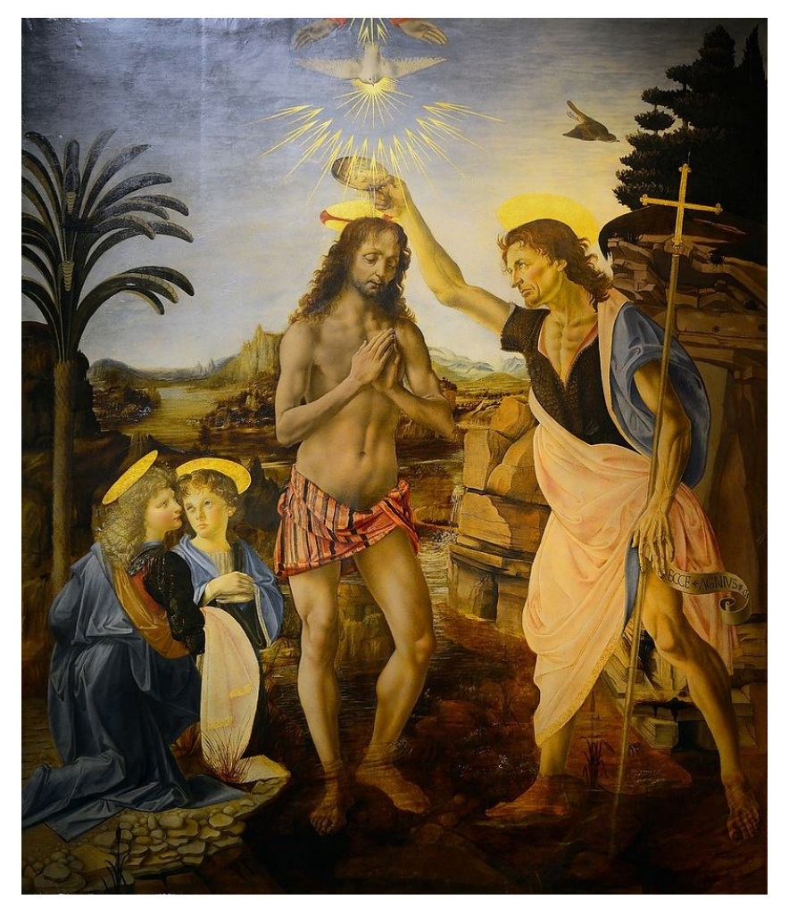
The Baptism of Christ, 1472–1475 Andrea del Verrocchio & Leonardo da Vinci

ightharpoons All stand as able at the sound of the tower bell.