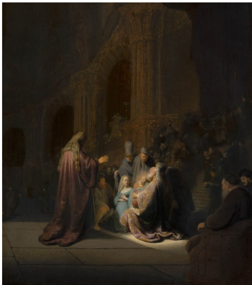
Simeon's Song of Praise, 1631 Rembrandt van Rijn