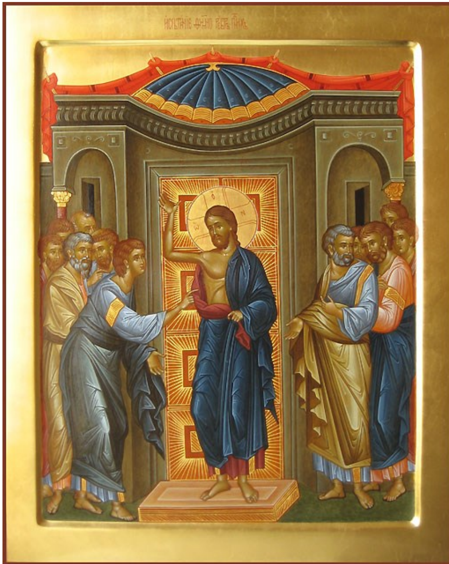
From the altar of the Church of St. John the Baptist Chesmenskaya, Russia