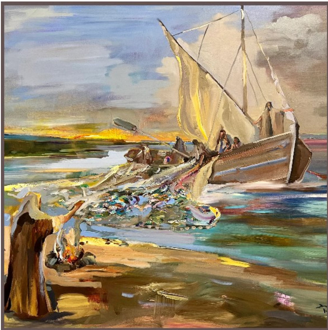
153 Fishes Dirk Walker