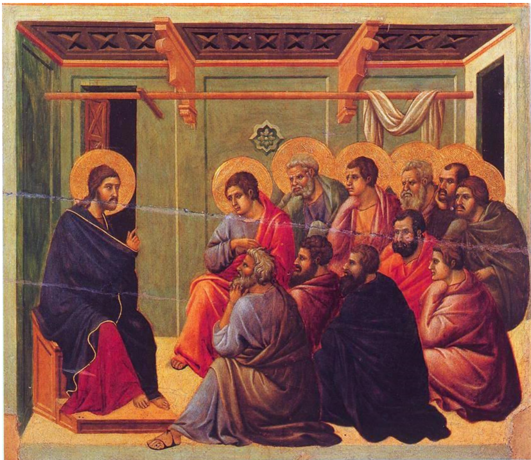
Jesus giving the Farewell Discourse to his eleven remaining disciples after the Last Supper, from the Maestà by Duccio, c. 1310