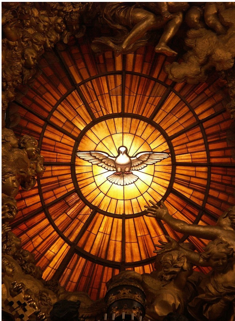
Depiction of the Christian Holy Spirit as a dove, by Gian Lorenzo Bernini, in the apse of Saint Peter's Basilica, c. 1660

All stand as able at the sound of the tower bell.