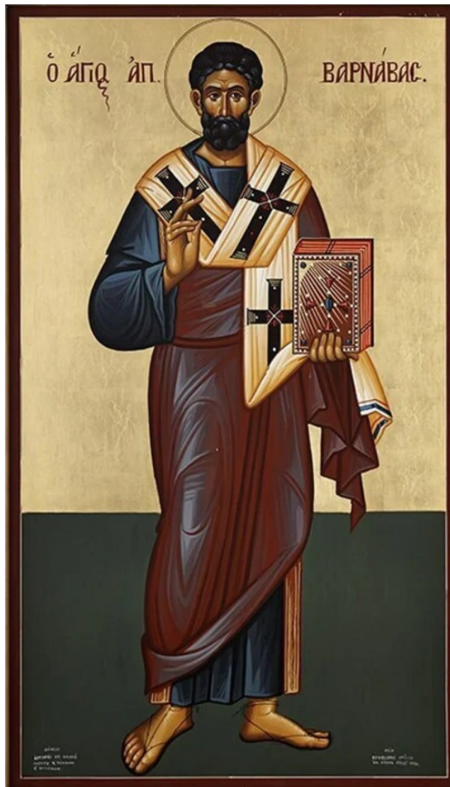
St. Barnabas Orthodox Icon

All stand as able at the sound of the tower bell.