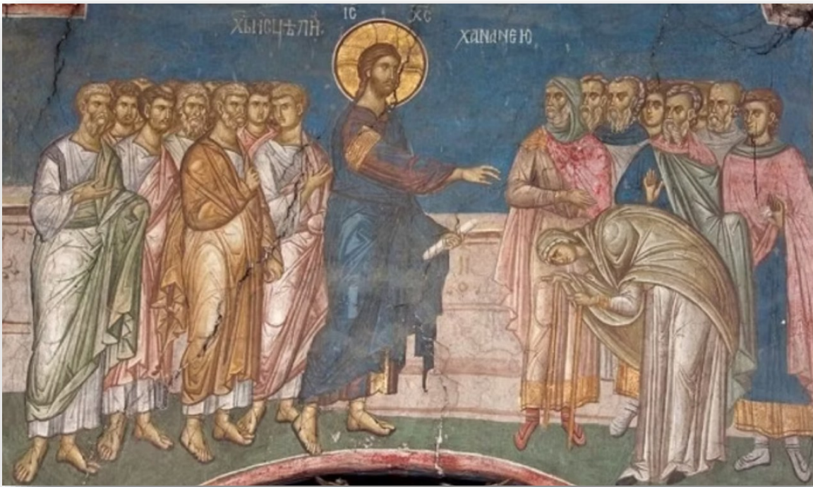
Icon, Jesus Heals the Bent Over Woman

All stand as able at the sound of the tower bell.