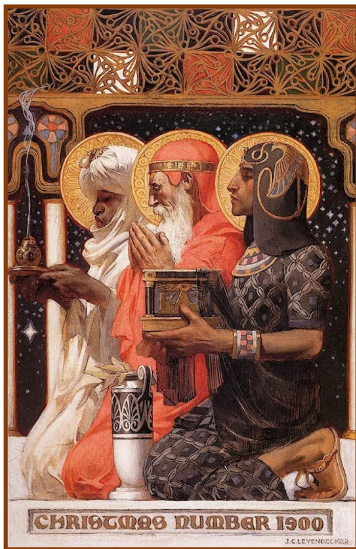
Three Wise Men

Joseph Christian Leyendecker (1874-1951)