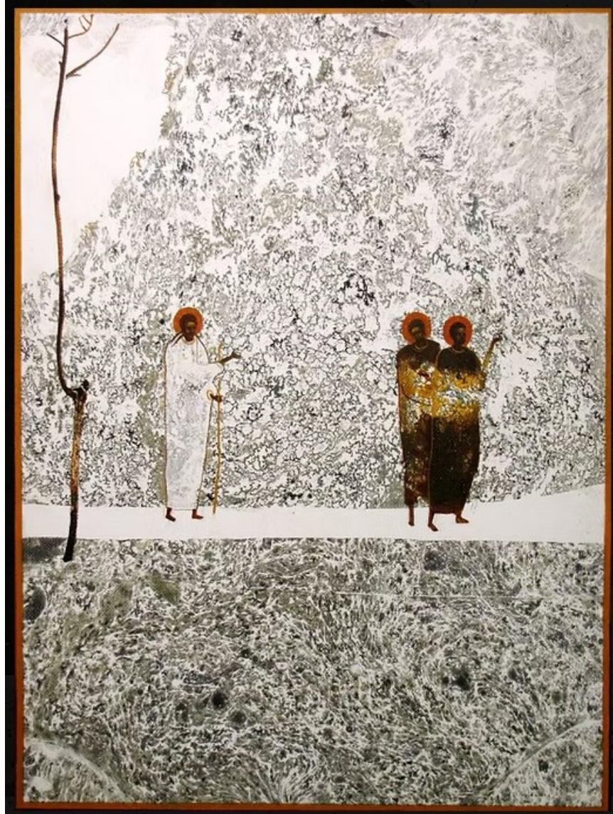
Road to Emmaus Ivanka Demchuk, b. 1990