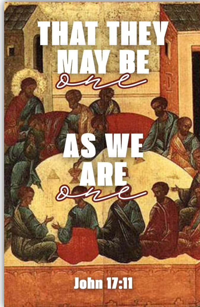
Mystical Last Supper, Anonymous 1497, Russian Icon